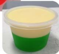
Jelly & Custard Cup