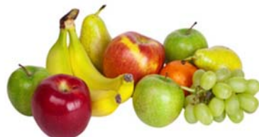
Fresh Seasonal Fruit