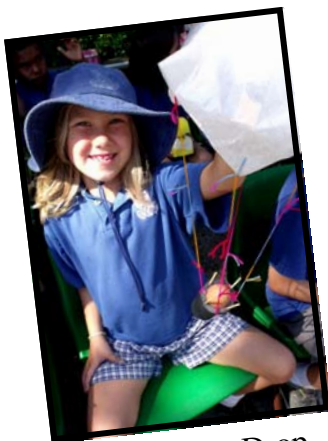
Year 2 Egg Drop

*Other than the school uniform shop, alternative local outlets for ready made uniforms Trustwood Trophies & Spirited Clothing.