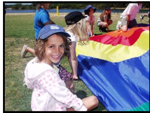
Gold Day Games at Bellwood

ZEBRA (PEDESTRIAN) CROSSING: The Main Entrance to the school is in Wallace Street and this is clearly marked by a pedestrian crossing. The crossing is controlled from 8:30 am to 9:15 am and from 3:00 pm to 3:45 pm by a crossing attendant provided by the RTA. Parents and children using the crossing at the above times are under her direction. Parents are asked not to park in the Bus Zones at the times indicated on the roadside signs, and to strictly adhere to the No Standing Zones on either side of the crossing.