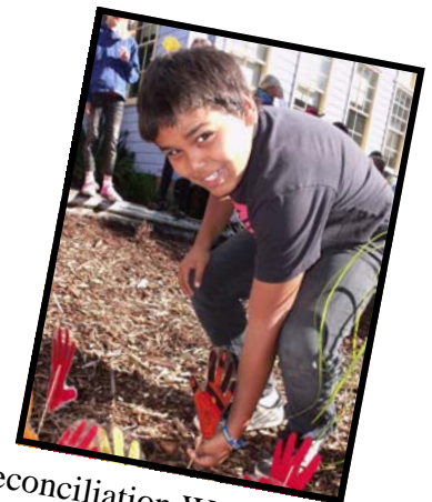
Reconciliation Week Activities