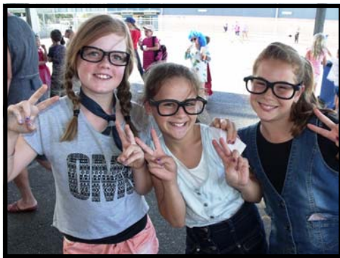
Dressing up for Gold Day!